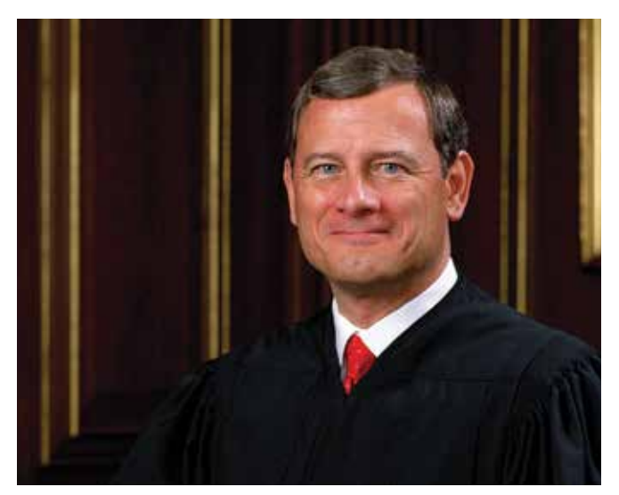
John G. Roberts, Jr., Chief Justice of the United States of America

hearings and fact-finding, including examples of the importance of preclearance in preventing discriminatory voting changes as recently as 2006, that led to the bipartisan renewal of sections 4, 5, and the rest of the Voting Rights Act in 2006. This included the conclusion that extensive evidence of "continued discrimination" showed the "continued need" for sections 4 and 5 to prevent racial and language minorities from being "deprived of the opportunity to exercise their right to vote."54 But the Court majority, she pointed out, had made "no genuine attempt" even to "engage with the massive legislative record" amassed by Congress.55 Instead, she explained, the 5-4 majority had relied on improvements concerning voter registration and other areas, which had been acknowledged by Congress but which Congress had found insufficient to justify eliminating critical Voting Rights Act protections. The majority's decision, she concluded, erroneously failed to accord to Congress the "substantial deference" that prior Court precedents required, improperly overruling a congressional law that had "overwhelming bipartisan support." 56 The result, she lamented, was a 5-4 ruling that struck at "the heart of the Nation's signal piece of civil-rights legislation."57