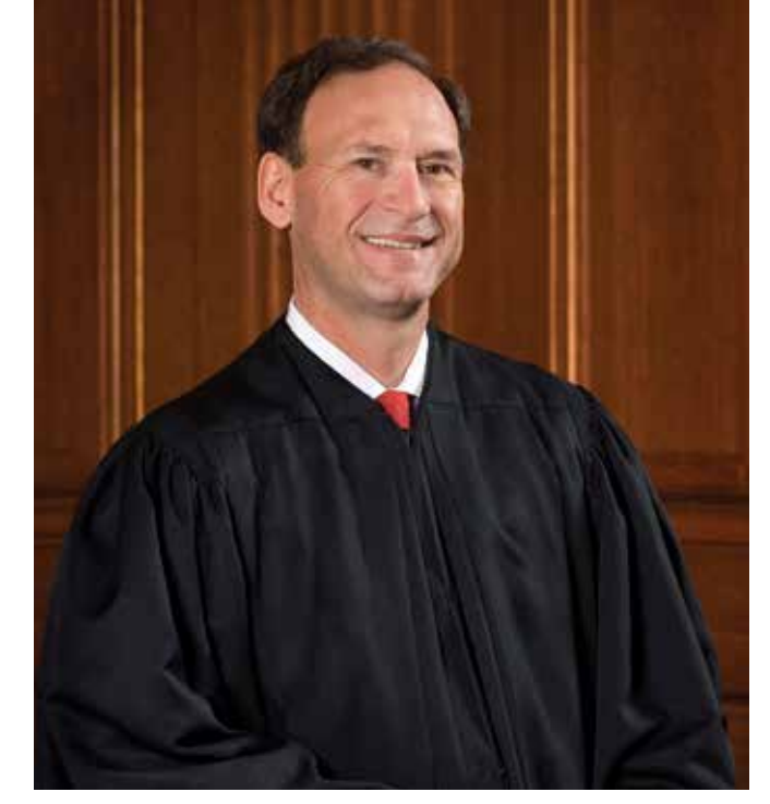
Samuel Alito, Associate Justice of the Supreme Court of the United States.