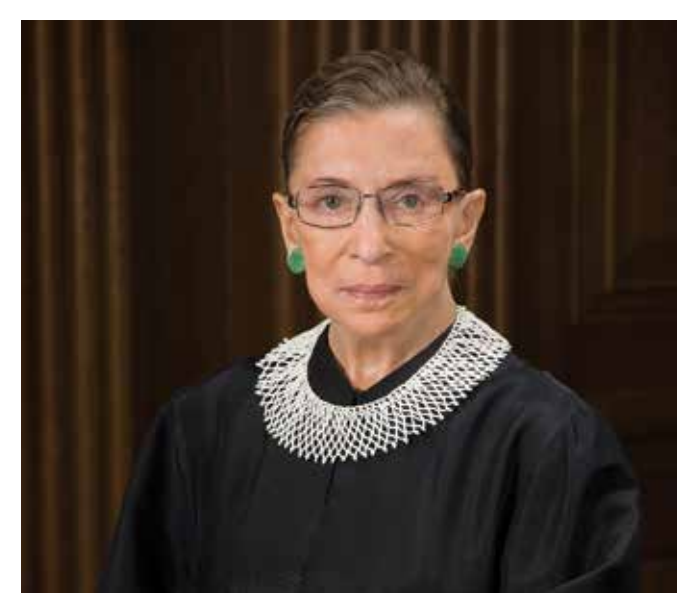
Ruth Bader Ginsburg, Associate Justice of the Supreme Court of the United States

Hobby Lobby claimed that the requirement that it provide contraceptive coverage to employees under the ACA violated the Religious Freedom Restoration Act (RFRA). As Justice Ginsburg explained, and as the language, history, and name of the law made clear, RFRA was designed to restore, as a matter of federal statutory law, the protection for religious liberty that the Constitution had provided under Supreme Court doctrine prior to the Court's decision in Employment Division v. Smith, 494 U.S. 872 (1990). But Justice Alito's majority opinion claimed that RFRA provides "very broad protection for religious liberty" that is "even broader" than was available under the First Amendment under Smith. This led the majority to misinterpret RFRA, in Justice Ginsburg's words, as a "bold initiative departing from, rather than restoring, pre-Smith jurisprudence."103